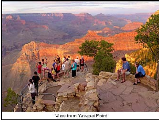
View from Yavapai Point

The South Rim Bus excursion lasts approximately 14.5 hours (hotel to hotel) Return time approximately 9:30 pm