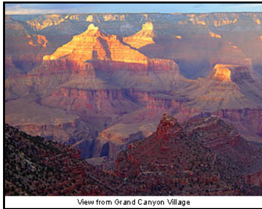
View from Grand Canyon Village